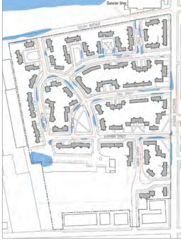
SUBBASINS AND SURFACE WATER FLOW